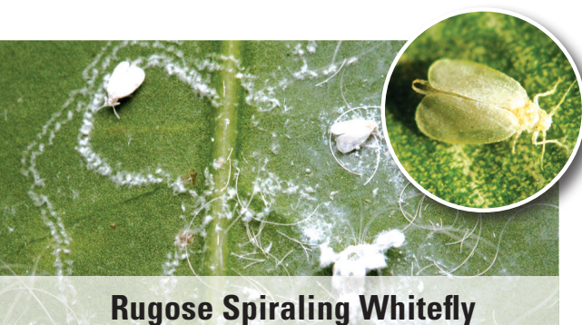
Rugose Spiraling Whitefly

Inject your trees and palms with IMA-jet and AzaSol™